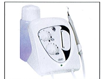
DTP00765 Swift w/ 500 ml Reservoir Btl.