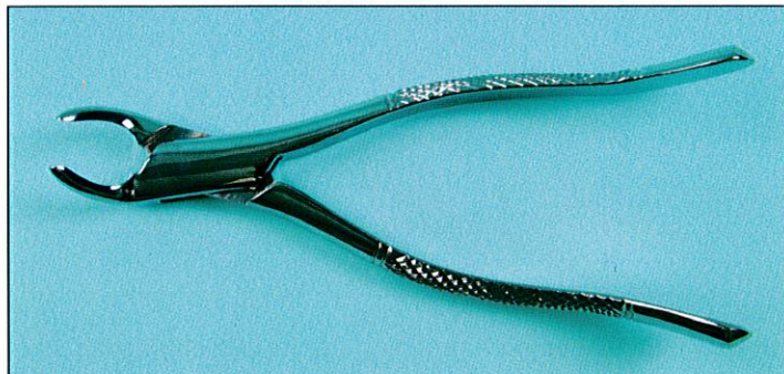
DTP20645 – Large Extracting Forceps (6-1/2") Useful for large canine teeth, premolars and molars.