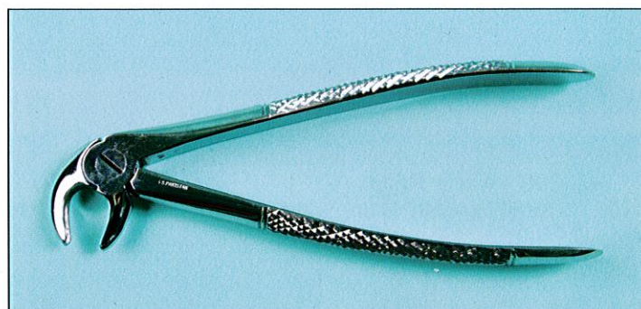
DTP13914 – (5-1/2") Extraction Forceps with right angle Excellent for small incisors and caudal teeth.