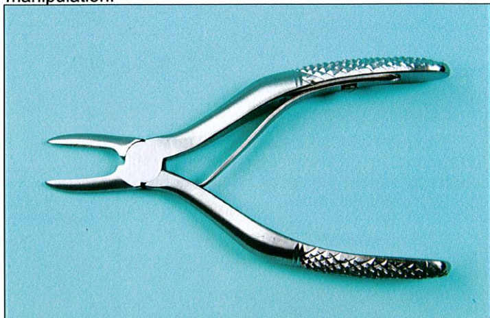
DTP10645 – Small Extracting Forceps (4-1/2") Beak tips are flat and close completely. Perfect for small cats teeth.

Small extraction forceps are excellent for grasping small teeth (especially in cats). All have spring action for easy manipulation.