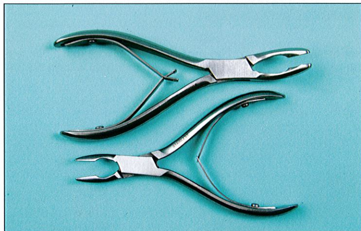
DTP10644 – Small Rongeur Forceps (4-1/2") DTP20644 – Medium Rongeur Forceps (5-1/2") Useful for gently grasping flat surfaces of large teeth (i.e. canine) for extraction.