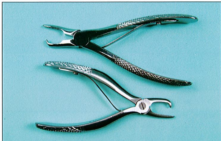
DTP11305 – Tartar Remover Forceps - Small (4-1/2") DTP11307 – Tartar Remover Forceps - Large (5-1/2") Designed to remove heavy deposits of calculus from the teeth.