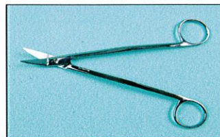
Serrated / Curved Dean Scissors (7") DTP30960